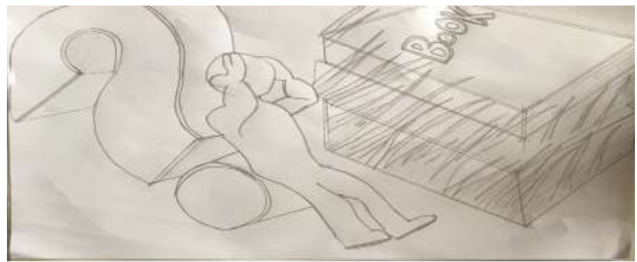
Figure 1: Drawing #1

The overall impression of the first drawing was that the person was overwhelmed by the reading task. The books looked rather thick. Jessie explained that the large question mark was intended to express the endless questions she had in attempting to make sense of the contents. The fire surrounding the books expressed her strong wish that those books would someday be burned to erase her horrendous university reading experience.