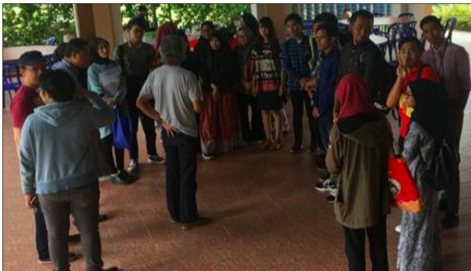
Figure 2: Initial Information Session from the Dean of the FSRD-ISBI