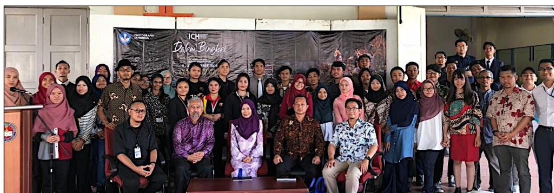
Figure 3: Memories Photo Session in Opening ceremony of JSRB-FSRD 'Dalam Bingkai' Exhibition with ISBI Delegation and Officiating Invitations

Researchers see that artists have high potential throughout the process of involvement in art and culture. However, in some cases, researchers are well aware of the condition several artists are still in the preliminary phase. The exhibition should be further strengthened with special guidance and non-verbal sharing from curators to manage and evaluate the findings of their work. There is most satisfying that secretarial establishments are working hard to find the most effective way of communicating knowledge. The arts and culture sharing program involves selected individuals who are trained as an artist. The artist develops their capabilities and brings the institution of study which always provides endless support. In particular, this article captures the field exhibition of the art and cultural sharing program as a document to share a concern audience. To achieve the optimum level, the entire organization of the joint program strives to meet the more scholarly art forms. Shared a memorable session during the opening ceremony of the JSRB-FSRD 'Dalam Bingkai' exhibition with the ISBI delegation and the Invitational Exhibit in Figure 3. Hopefully, this show will reference specific knowledge from the needs of all organizations in raising awareness of the arts and culture sharing program.