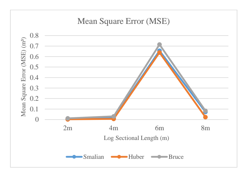
Figure 3: The variation of mean square error (MSE) for each log section.

Furthermore, Bruce's formula shows the lowest value of standard deviation (SD) for all log sectional length. A standard deviation measures the dispersion of data and indicates precision in the estimation. Hence, it can be said that Bruce's formula is the most precise method. However, higher in precision does not indicate a high in accuracy and vice versa . In this study, this applies to Bruce's formula and Smalian's formula. This is because Bruce's formula shows the highest value of MSE for all log sectional length. Not only that, Bruce's formula also reported the highest bias for all log sectional length. For the case of Smalian's formula, it records the highest value of standard deviation (SD) for all log sectional length tested in this study.