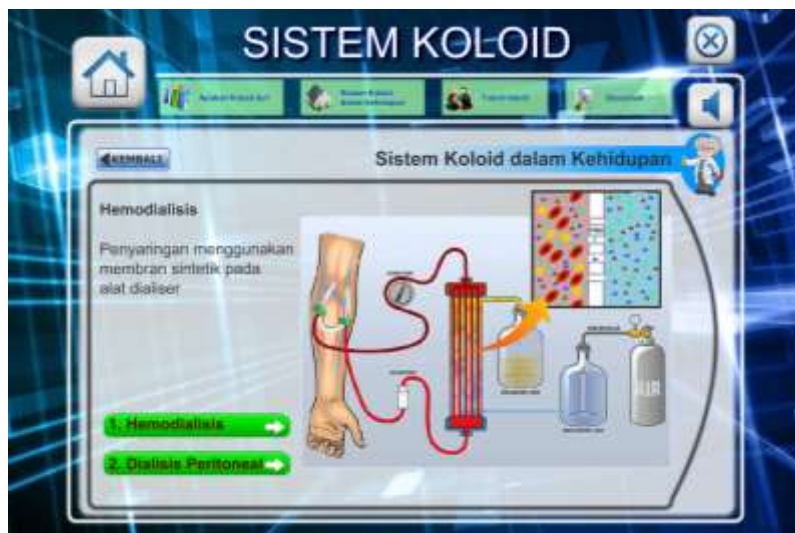
Figure 2 Sample of Multimedia Content

The enrichment multimedia was easy to operate. The difference in specification of PC or laptop, however, can affect the smooth operation of this multimedia. Not all explanations in multimedia equipped with animation or video. This also multimedia had not been tested to students, so the effect of multimedia of chemistry enrichment to students had not known yet.