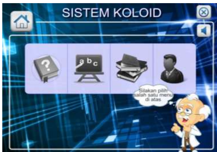
Figure 1 The Home Page of Multimedia

Multimedia of Chemistry Enrichment in Colloidal Systems was developed for Vocational High School Students. The multimedia can be operated on the laptop or personal computer (PC) and can be used for learning both inside and outside school. The multimedia was developed using the Adobe Flash Professional CS 6 program. The product was packaged in compact disk with application (.exe) format.