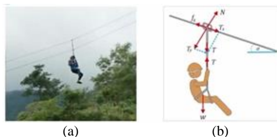
Figure 1. (a) Flying fox ride (b) Forces that work on flying fox ride.

One of the learning methods that makes it easier for students to learning physics while observing natural phenomena directly around them is environment-based learning by utilizing tourist attractions as a learning resource or commonly referred as educational park or shortened edupark. Edupark is a natural or artificial garden that allows for learning process to help teachers and students find facts, formulate principles or concepts. This learning involves students making predictions, testing their conceptions and comparing them with experimental results through active participation [7]. Learning in the natural environment, especially in tourist parks, can be a solution in understanding the concept of physics [8]. Edupark integrated with physics learning is expected to reduce student misconceptions. One of the researches on physics learning based on Edupark is the development of Physics E-book of Bukik Chinangkiek Edupark which describes the dynamics of motion, work and energy on rides at Bukik Chinangkiek Park. Bukik Chinangkiek which is located in Singkarak has natural conditions and rides that are full of physics concepts so the Bukik Chinangkiek tourism park can be used as a source of learning physics. [9]. One of the rides in Bukik Chinangkiek Edupark is flying fox ride which contain the applications of Newton's law concept of the. The flying fox ride at Bukik Chinangkiek Edupark can be seen in Figure 1.