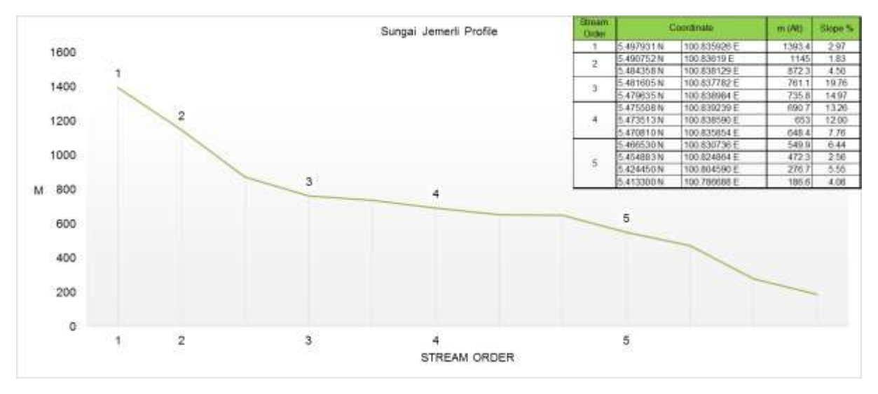
Figure 2 Sungai Jemerli sub watershed profile from order 1 to order 5, with coordinates with altitude (m) and slope percentage (Insert table)

L_{SM} at a drainage relate to the surface of the plains (Strahler, 1964). To obtain L_{sm} , stream lengths divided by stream order. The L_{SM} of the first order is 431.0 m (0.43 km), the second order is 584.63 m (0.58 km), third order is 1,802.48 m (1.8 km), the fourth order is 1,622.09 m (1.6 km) and the fifth order is 11,968.52 m (12 km). The gradient of the stream can be seen from the length of a stream (Singh & Gou, 1997), in this study, found the steep slope are at first order following second order, third order, then fourth order and the less steep is a fifth order (Figure 2).