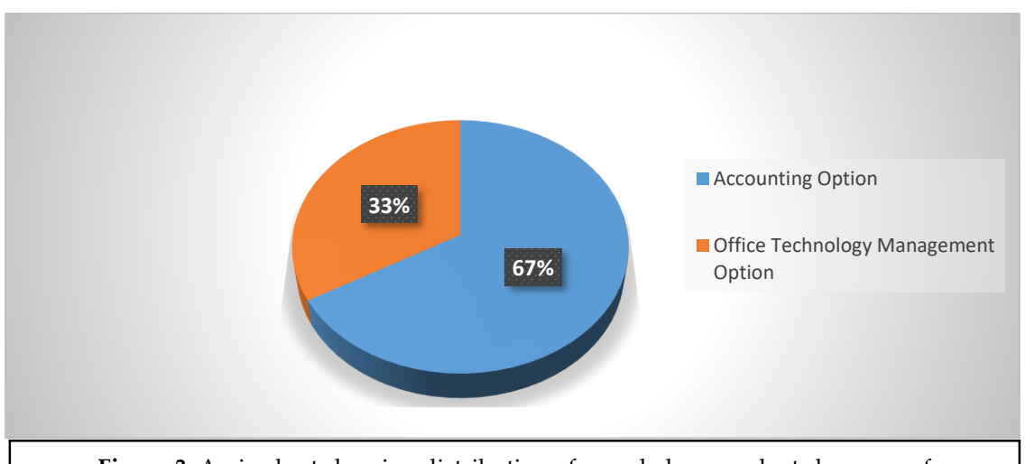
Figure 3: A pie-chart showing distribution of sampled respondents by areas of specialisation (%)

Figure 2 above shows the distribution of sampled respondents by gender. Majority of the respondents were females (64.8%) while 35.2% were males.