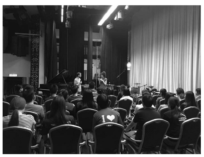
Figure 5. Image of running workshop on stage with presenters and musical instruments in front of participants