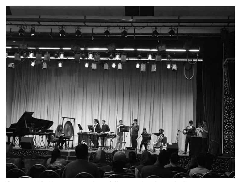
Figure 6. Concert with Passepartout Duo

Audiovisual recordings of the full concert and also of the whole two-day workshops were recorded and archived for future reference and documentation for the participants, department and faculty. For new composers, audiovisual recordings of their musical compositions are important for them to build presence online through Youtube for example, and also when applying studying programs in future. Photographs of composers, performers, and participants of both workshop and concert were taken and duly recorded for future educational or promotional purposes.