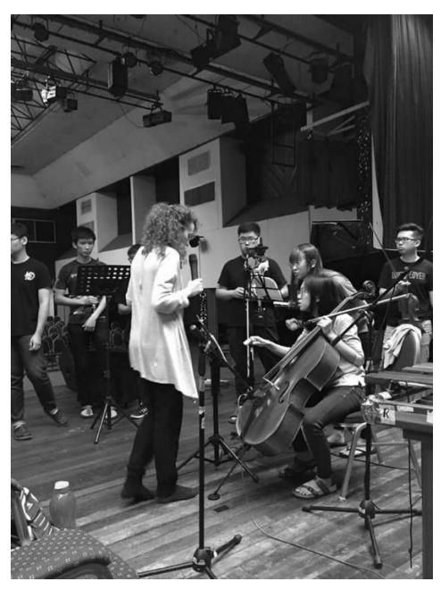
Figure 3. Group hands-on activity