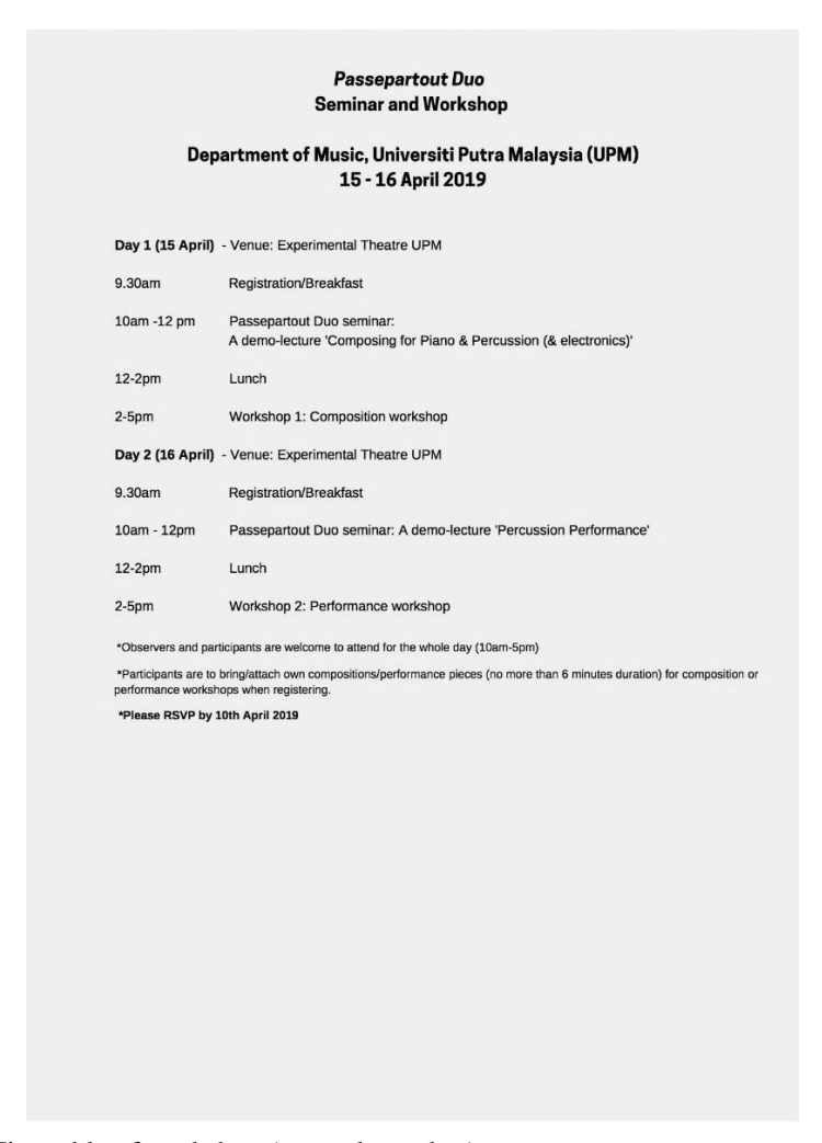
Figure 2. Timetable of workshop (poster by author)

The music composition workshop ran for two full days, with a morning session from 10am to 12 pm followed by an afternoon session from 2pm to 5 pm Lunch breaks were provided for participants in between both sessions. The same timetable was carried out as well on Day 2 (Figure 2). These times were pre-determined as suitable to meet the goals of the workshop. The times allocated matched the presentation content and amount of material Passepartout Duo will cover. Especially for participants, when new content is first introduced and in order to understand it, they will need more time for clarification and questions. Also a workshop of this length, 2-3 hours per session, will give opportunities to both presenter and participants to address ideas and concepts in some depth, and for presenters to teach some skills.