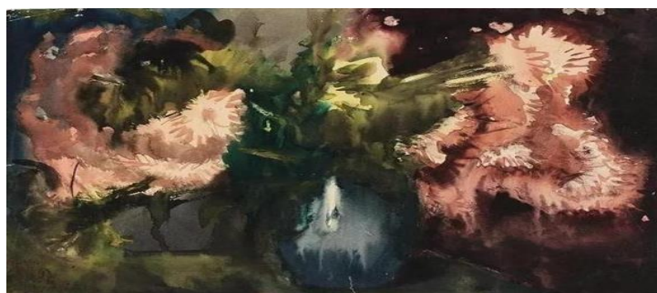
Figure 6. "Chrysanthemum in a Vase" by Li Tiefu (1933) Watercolor on Paper, 38.1cm x 58.3 cm

Guangzhou Academy of Fine Arts Art Museum collection