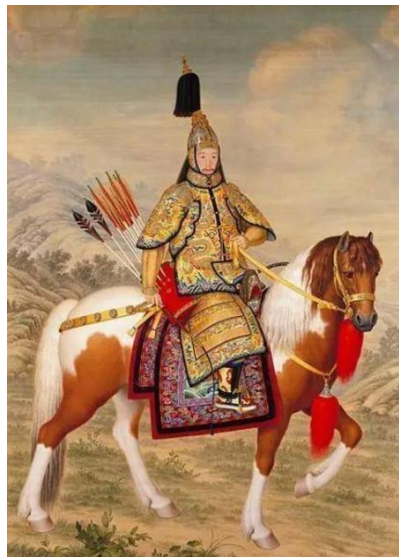
Figure 3. “The Qianlong Emperor in Ceremonial Armour on Horseback” (1758)