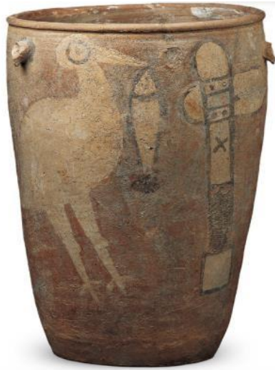
Figure 2. “Stork fish stone axe painted pottery tank” (Neolithic) White, brown and water, 47 cm x 32.7 cm x 20.1 cm