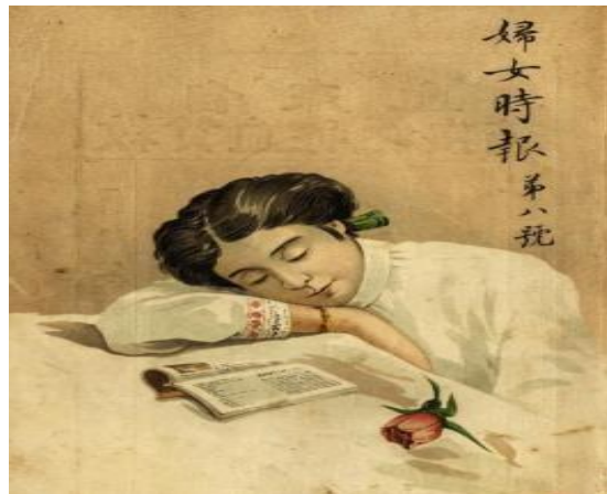
Figure 5. The cover of "Woman's Hour magazine" No. 8 (1912) Watercolor on paper

Cheng-Khee Chee (2007), a watercolor artist and assistant professor emeritus at the University of Minnesota, stated that Soviet painting styles heavily affected Chinese watercolor painting around the 1950s and 1960s. China employed Soviet painters as teachers and sent students to study in the Soviet Union. However, watercolor painting experienced a fall from 1966 to 1976 as a result of China's political upheaval known as the "Cultural Revolution" (Wang, 2017).