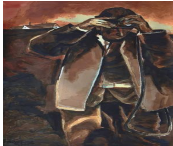
Figure 9. “Early Shift Miners” by Zhou Gang (2021) Watercolor on paper, 150 cm x 105 cm National Art Museum of China collection