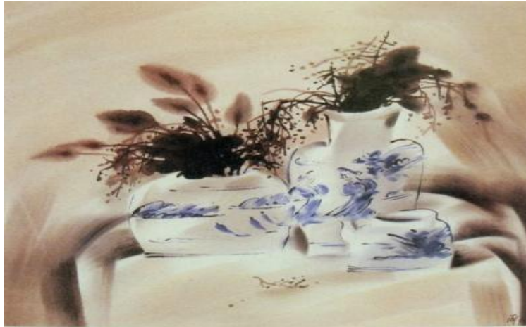
Figure 8. “Blue in Memory” by Wang Yong (1994) Watercolor on paper, 80 cm x 70 cm National Art Museum of China collection