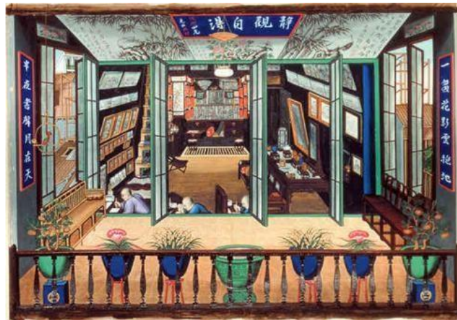
Figure 4. “Tinggua Studio” By Tinggua (about 1855).