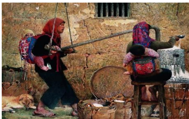
Figure 7. "Childhood Song" by Huang Zhongyang (1984) Watercolor on paper, 64 cm x 89 cm National Art Museum of China collection

In addition, contemporary watercolor painting has transformed from a traditional model to a diverse contemporary art form (Yuan, 2009, p. 269). In the early 1980s, Chinese watercolor painting was influenced by Western modern art (Gao, 2021). In terms of techniques, watercolor painters are also constantly advancing with the times, creating new creative techniques and experimenting with new media materials (Doluda et al., 2018). The style of watercolors have diversified, encompassing both realism and abstract deformation (see Figure 7-9) (Cheng-Khee Chee, 2007).