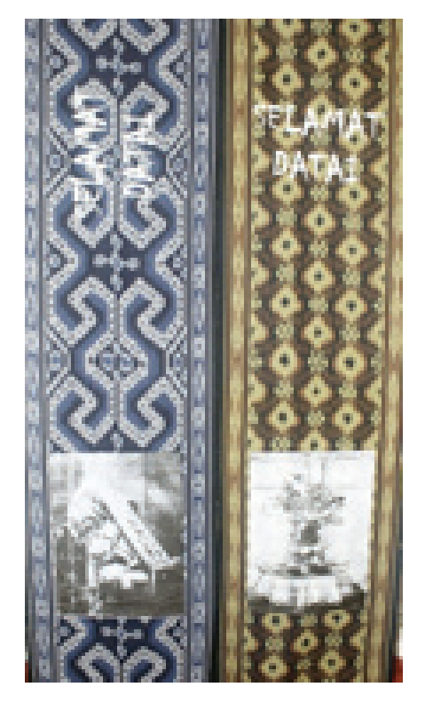
Figure 1 Pua 1, Pua 2, 2011 Silkscreen on cloth, 180cm X 88cm

Silkscreen printing was experimented with as a way to convey the intended meanings. During the solo exhibition, the artworks were placed in the tradition of Malay people welcoming their guests. The use of Tepak Sirih as a symbol of respect to guests started in the feudal era in the Malay Archipelago. Nowadays, it is still used in Malay weddings, hence, in my first work (Fig.1), the use of the word "Welcome" metaphorically signifies a cordial invitation for the audience to experience the exhibition. In Malay culture, guests are respected and should be addressed in a proper manner.