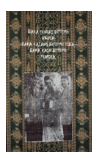
Figure 10 Pua 14, 2011 Silkscreen on cloth 107cm x 58cm