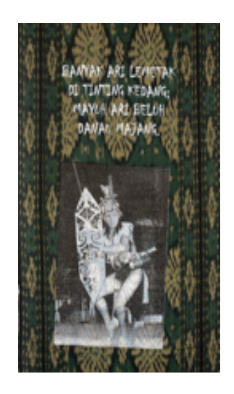
Figure 6 Pua 17, 2011 Silkscreen on cloth 107cm x 58cm