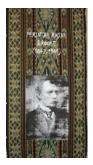
Figure 3 Pua 4 , 2011 Silkscreen on cloth, 107cm X 53cm.