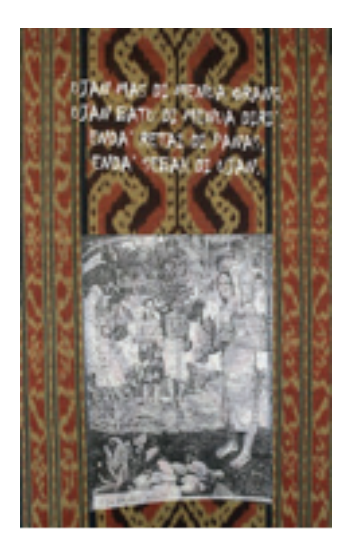
Figure 8 Pua 8, 2011 Silkscreen on cloth 107cm X 53cm

A prominent western image, 'La Orana Maria' or 'Hail Mary' (1891) by Paul Gauguin was also selected and appropriated in my artwork (Fig. 8) due the similarities of the elements, especially the clothing and ambience.