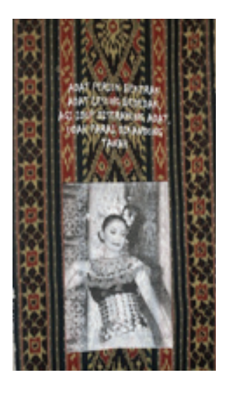
Figure 7 Pua 21, 2011 Silkscreen on cloth 107cm x 58cm

A prominent western image, 'La Orana Maria' or 'Hail Mary' (1891) by Paul Gauguin was also selected and appropriated in my artwork (Fig. 8) due the similarities of the elements, especially the clothing and ambience.