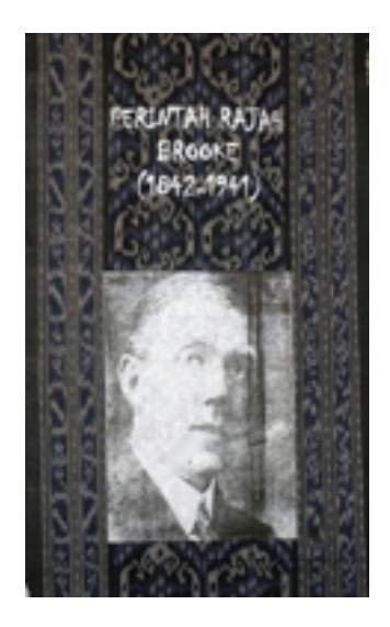
Figure 4 Pua 5 , 2011. Silkscreen on cloth, 107cm X 53cm.

My thirteen years' experience of teaching in Sarawak revealed the impact of colonialism on the social strata of the Sarawakian community during British rule. This occurred when Indonesia claimed Sarawak as part of their country and the Philippines claimed Sabah, which was under the rule of the Sulu Kingdom, which is a part of Muslim government who controlled the Sulu Sea in South Philippines. When Malaysia was created in 1963, people from Sabah and Sarawak decided to be part of Malaysia. In relation to what Ashcroft (2000) has mentioned, "the creation of new transcultural forms within the contact zone", colonisation has affected the local cultures. Buildings, transportation, religion and the formation of the residential areas were heavily influenced by English culture. Before constructing these type of artwork, my previous artwork dealt with icons related to the Sarawakians. Thus, the selection of "The White Rajahs of Sarawak" - James Brooke, Charles Brooke and Charles Vyner Brooke, who ruled Sarawak for almost hundred years - suits the theme of external influences having an impact on traditional Sarawakian culture.