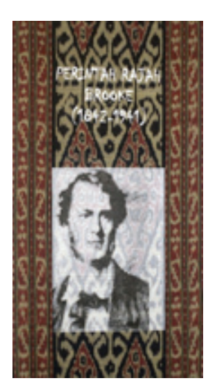
Figure 2 Pua 3 , 2011 Silkscreen on cloth, 107cm X 53cm.