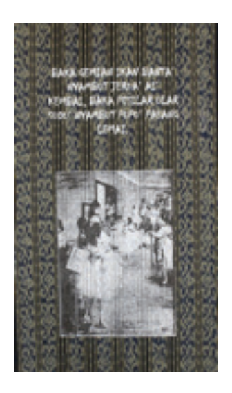
Figure 5 Pua 6, 2011 Silkscreen on cloth 107cm X 53cm