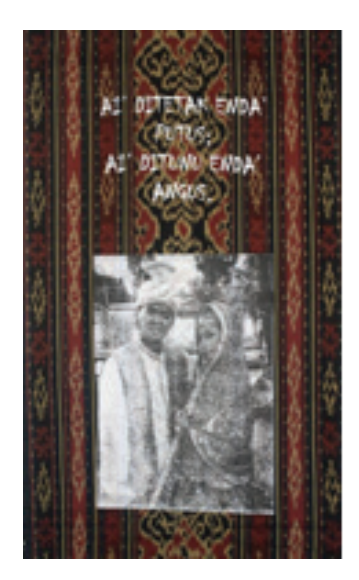
Figure 9 Pua 13, 2011 Silkscreen on cloth 107cm X 53cm

One of the biggest impacts of colonisation in Malaysia is the presence of Indians and Chinese in the Malay Peninsula. The British brought in the Chinese to work in the mining sector and the Indians in the rubber plantations. The divide-and-rule strategy had been implemented by the British to split the Malay, Indian and Chinese into different areas of the economy. There was no unity among the races and the British government in the Malay Peninsula easily ruled the nation before Independence Day. When the Chinese and Indian remained in Malay Peninsula, it was important for them to be integrated with the Malay population. Through the spirit of independence for the country, the Malay majority were willing to play a part in the development of the political, economic and social fabric on 31st August 1957, Independence Day of Malay Peninsula. This has shaped the local cultural landscape, leading to these minority groups being granted permanent residency. The Indians brought with them their cultures and freely practised them, and now are already generally accepted as part of the vast identity of Malaysia. Now, the Indians are accepted as a part of the Malaysian family, and this symbiotic relationship blossomed into unique Malaysian cultural hues (Fig. 9).