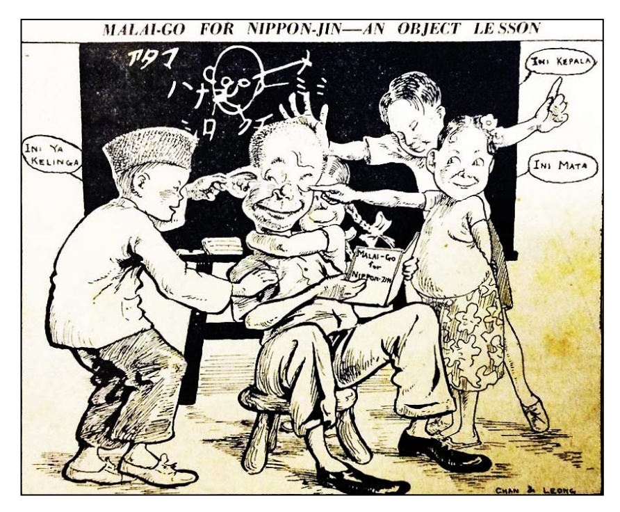
Visual 2: Cartoon Malai-Go For Nippon-Jin-An Object Lesson , Malai Sinpo newspaper, 24th April 1943

Visual 2 is a cartoon that was aired on Saturday, April 24, 1943, by cartoonist Chan and Leong. A pro-Japanese propaganda with the message of spreading the usage of the Japanese language among the people of Malaya, is clearly presented by the cartoonist, in support of Japan's efforts and endeavors. The Japanese male characters are manifested friendly with the kids, who do not mind being treated by them. The smiling and expression-friendly face, expresses the significance of reinforcing relationship, between the regime and the people. The Japanese man, seem to be willing to be hold and pulled on their limbs by the three children. It carries a very effective propaganda message, that penetrate into the heart of the readers. The military and the Japanese, are often referred to as bad, violent and abusive elements, but the cartoons shows otherwise. The cartoonist tried to soften the character of this Japanese man, depicting a girl hugging him closely, while smiling. In a deeper context, this means that the people of Malaya and the security of the Malays are guaranteed by the Japanese. This image also serves as a precursor, to the Japanese call for liberation of Asia from the British grip, with the slogan; 'East living in East, West living in West, East increasingly prosperous, West increasingly destitute'.