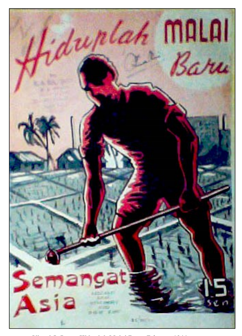
Visual 5: Poster Hiduplah Malai Baru, February 1944

Visual 5 is a poster dated on February 15, 1944, marks the second anniversary of Dai-Nippon's, success in liberating Malaya and Singapore ( Syonan To ) from the British. The image of a man working on paddy fields, brings meaning to the community's support to agrarian campaigns and policies. The strong and stout figure, envisions the indispensable workforce of youth that contribute to the reform and transformation efforts, organized by the Japanese Government. Healthy and energetic youth is an important asset to the government, as a frontline to defend its rule in all aspects. The 'New Malai' (New Malaya) doctrine, sparked by the Japanese, encouraged agricultural activities (cultivation), cultural transformation and a new educational system. The Japan's systematic and state-of-the-art doctrine, were designed to replace the old order and systems adopted from Europe. The Japanese Army administration encouraged Malaya to cultivate, more than what the British had endeavored.