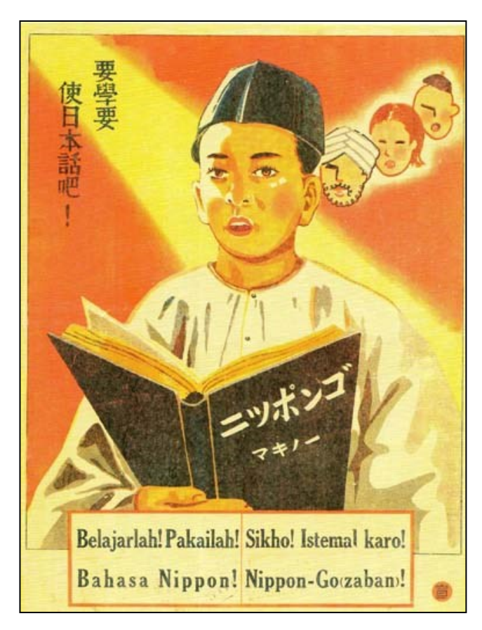
Visual 4: Poster 'Belajarlah! Pakailah! Bahasa Nippon!', circa 1943

Visual 4 is a poster illustration that encourages Malayan people to learn Japanese language ( Nippon-Go ), by the artist Y.Kurakane (Yoshiyuki Kurakane). The 48 cm x 71 cm poster, is released around 1943, that shows a serious effort by the Dai Nippon , to introduced the Japanese language to the people of Malaya. The Japanese intend to make Nippon-Go as 'lingua franca', capable of being a nation's medium of speech, in a greater commonwealth that includes East Asia. It was issued by Senden-Bu (Propaganda Department), based in Singapore. Complementing this pictorial poster, is the text in Malay ( rumi ), English and Japanese ( katakana ), to enable observers to visualize the visual meaning clearly.