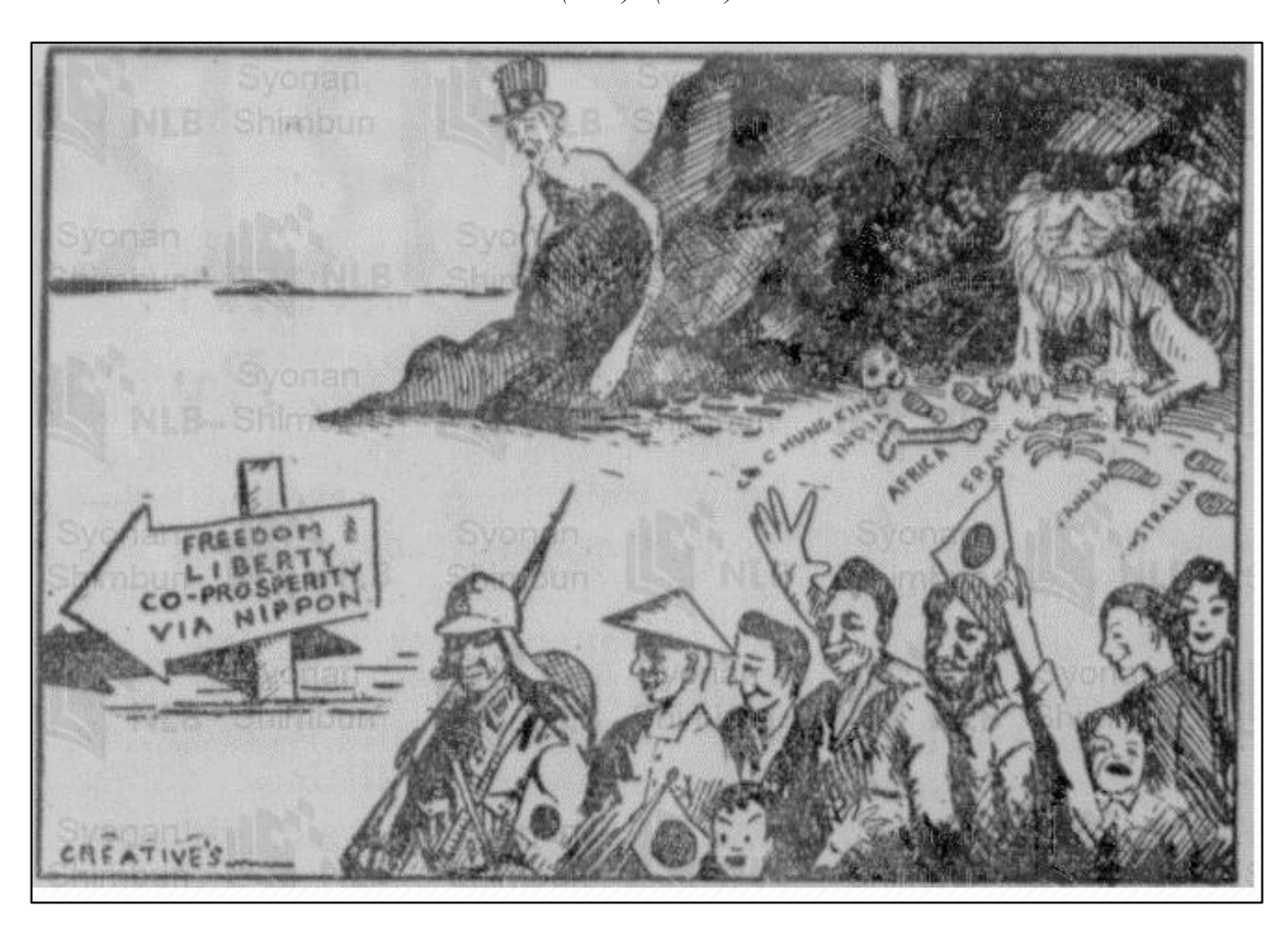
Visual 6: Cartoon Freedom, Liberty & Co-Prosperity Via Nippon, Syonan Shimbun Fortnightly newspaper, 6 Jun 1945

Visual 6 is a visual propaganda cartoons using the title Freedom, Liberty & Co-Prosperity Via Nippon (Freedom, Independence & Commonwealth Together with Japan) that is circulated during the edges of the Second World War. The cartoon is broadcasted two months before the giant explosion in Hiroshima, which serves as a strategy in the last minute, to mobilize the masses, to stay together and support the Japanese side. The notion of the end of the war that is not in favor of Japan, is still manipulated by visual images, reflecting the unwavering support of the Asian people to them. Westerners, such as the United States and the British, are manifested as barbarians, ferocious animals, but frustrated and hungry, resulting in a fatal war. This can be noted in the image of skulls and bones, which bears the effects of greed and humanitarian conflicts with the damaging effects, devastates and injures the western-occupied countries such as Nanking, India, Africa, France, Canada and Australia. A manufacturing consent, which uses visual as a powerful entity, is perceived to be effective to impact the audience.