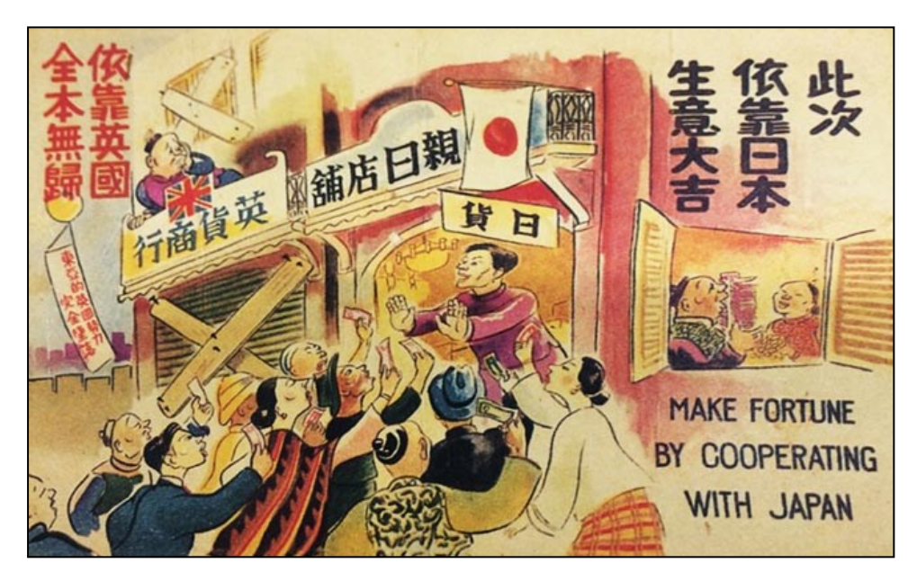
Visual 4: Leaflet 'Make Fortune by Co-Operating with Japan', circa 1943

Visual 4 is a leaflet entitled "Make Fortune by Co-Operating with Japan", circulated in 1943, that encourage the people Malaya, to work with Japan through business and trade activities. Images of a group of people, who stormed Japanese-owned business premises, can be identified, through the visual of the Hinomaru flag as an entity, or a symbol of the owner of the premises. The katakana -written texts, on the signage of the shop reads 'Japanese Store' and 'Japanese Goods'. The activities of buying daily necessities, brings the meaning of purchasing power, among the consumer society to boost economic activity during the occupation period. In the top corner of the leaflet, exposed a figure of an English man, with his depressing face expression, lifting his chin with his hand that aims to describe the British, who is facing bankruptcy. The closure of a British store, is symbolically related to the British embarrassing defeat in the campaign of the Great Eastern Asia Great War ( Dai Toa Senso ).