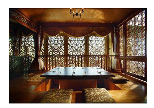
Figure 3. The usage of awan larat as a privacy device as well as a decoration.

Another function of the awan larat motif is privacy. In the restaurant inside the Royal Chulan Hotel, the awan larat motifs on the wooden panel serve as a decoration as well as to provide privacy. The motifs provide privacy for diners inside the restaurant from the outside, similar to the usage of the awan larat motifs on 'pemidang' in the traditional Malay houses. Figure 3 below shows a picture of a private dining area in the hotel restaurant. The motif used is similar to the decorative panels on the hotel lobby, which is the Awan Larat Jawi that were carved using the 'teknik tembus'.