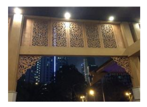
Figure 4. The usage of Awan Larat motif as weather protection device.

characteristics with other wooden decorative panels inside the hotel namely Awan Larat Jawi that were carved using the technique 'tebuk tidak silat'. 'Awan larat tebuk tidak silat' can clearly be seen on the 'sesiku keluang' on the hotel eaves.