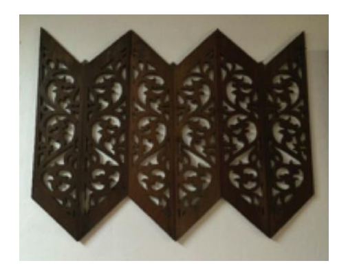
Figure 6. Wooden panel a wall decorations

Sabrizaa Rashid et al. (2021), as to beautify the decoration of the house, it is also has constructed to metaphor spiritual factors such as religion, cultural values, and way of life. Figure 6 shows a wooden panel used as a decoration on the interior wall that visibly displays 'sulur bayung' pattern. This awan larat motif shows the fineness of human's character while the curvy leaves represent Malay's politeness. The motif also symbolizes Allah nature that has no beginning or end (Hamdzun Haron et al., 2014).