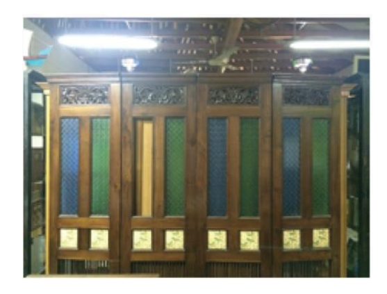
Figure 7. Awan Larat motif decorated on the panels which called as Pemidang.

Another function of the awan larat motif that can be seen in this house is the 'pemidang' that functions as an area or space separator. The awan larat motifs were carved into a series of panels, which were then used as a space separator to create different spaces within the same area. Pemidang is not permanently mounted; therefore, it is flexible to be moved around to be used in different spaces for different occasions. Figure 7 below shows a picture of pemidang or space separator used in a contemporary house. The awan larat motif carved on the panels used the 'ketam guri' flower motif that symbolizes spirit (semangat). Sumardianshah Silah, Ruzaika Omar Basaree, Badrul Isaa and Raiha Shahanaz Redzuana (2013) stated that "The structure must be balanced and harmonious with the whole structure. Based on the characteristics of the motif, it is arranged proportionately to be framed or in boundary during the first phase. The main structure line should move in parallel and interlay with the flower and leaf motif in order to make the eye focus on the internal area of the motif."