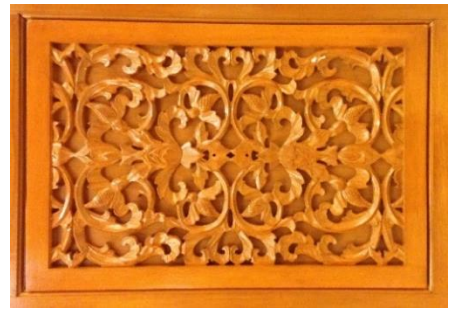
Figure 2. Decorative elements found throughout the hotel lobby.

Figure 2 shows awan larat motifs that were used as decorative elements found throughout the Royal Chulan Hotel in Kuala Lumpur. Picture (a) and (b) display the hotel lobby that use wooden panels with awan larat motifs as the wall decorations. These panels clearly shows the concept of Awan Larat Beribu, which the vase acts like the 'ibu' or 'punca' (source) of the emerging plants. According to Hamdzun Haron, Nor Afian Yusof, Mohamad Taha and Narimah Abdul Mutalib (2014), "There were several reasons for this, among them was due to its role in Malay's life as decorative plants to beautify the house's surrounding such as bougainvillea, orchid, hibiscus, sunflower, chrysanthemum, amaryllis, gardenias and sida. Some also function to flourish and scented the garden such as rose, jasmine, ylang-ylang, frangipani and Spanish cherry. Usually, these plants were planted on the ground or in a flower pot." The other two panels on the upper wall display another type of awan larat, 'Awan Larat Jawi' which uses the 'teknik tembus' (translucency technique) on the carvings. The panels with holes were placed on top of a lamp and act like a lampshade that casts beautiful shadows when the lights are turned on. Picture (c) is a decorative panel found on the wall of the hotel lobby. The awan larat motif carved on the wooden panel is 'motif bunga semangat'. "Bunga semangat and lotus applied as a motif in handicraft came from the influence of Hinduism" (Hamdzun Haron et al., 2014, p. 174).