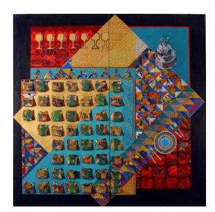
Figure 7. Din Omar, "Nasi Bungkus: Antara Dua Hidangan", 1991, 214 cm x 107 cm, Mixed Media on Canvas (Image Source: Seni lukis Moden Malaysia).

Din Omar applied multiple metaphors in order to better convey a language that is universally understood in his cultural sphere. The decision to use "Nasi Bungkus" was a conscious one, as the artist believe it to be an intimate element relevant to his society (Seni Lukis dan Idea, 2006). It could also carry a meaning of prosperousness and "Rezeki" or material blessing for the members of community.