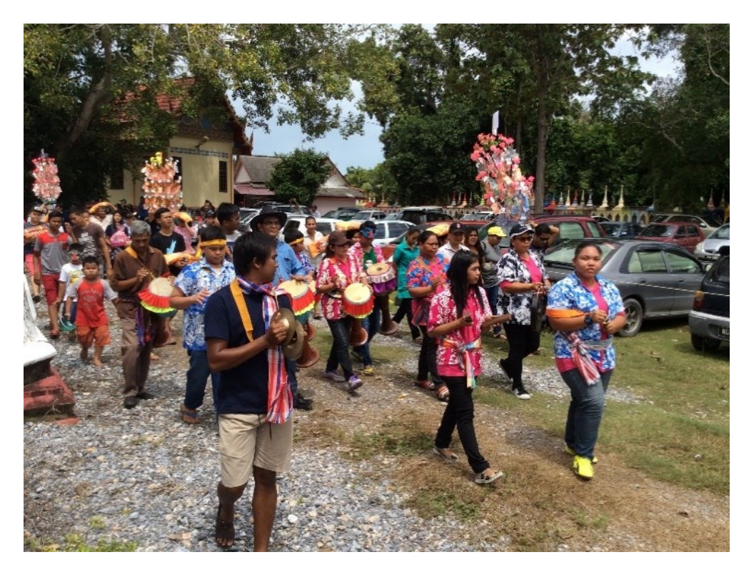
Figure 3. Klong yao in Tod Krathin ceremony, Macchimaprasit Temple 2016

as an essential part of the religious ceremony that took place in the Buddhist temples.