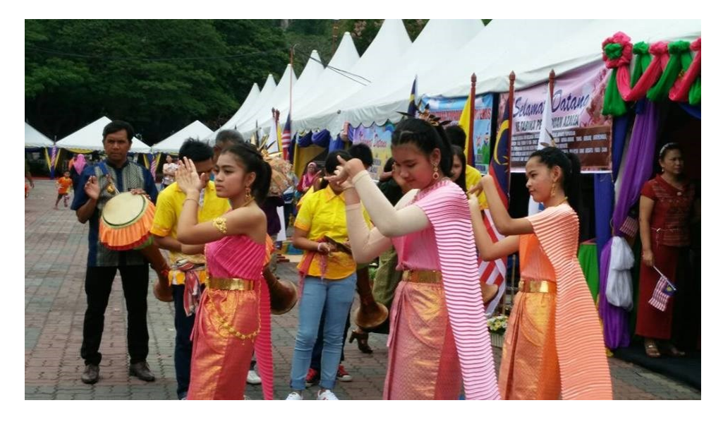
Figure 4. Dancing and playing the klong yao at Merdeka Day 2016

Malays also acknowledge klong yao as representing Thai culture of the Siamese communities by allowing a performance during the celebration of Merdeka Day. Every year on 31 August, officially proclaimed as Merdeka Day, all Malaysians celebrate Malaysia's independence from the colonial British, (see Figure 4 below). The Siamese have long been known as people residing at the northernmost area of the Malaysian peninsular. They are also members of the Malaysian nation and treated as bumiputera according to the applicable law. The Siamese have never denied they are Siamese Malaysians in the midst of the development of a Malaysian image and presenting a Siamese identity. They use the klong yao to promote Thai performances of tradition and culture. The dance movements harmonised with the rhythm of the klong yao distinguish them from other ethnic groups. Merdeka Day lets the performers to openly exhibit Siamese cultural heritage.