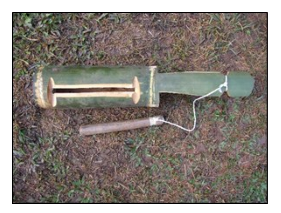
Figure 5. Picture of the koe-lo

Phowa, 60-years-old, asserts that the best koe-lo is made from bamboo aged at least three years and perfectly straight. These characteristics produce the best sound quality. They also will not crack as easily. For this reason, most prefer to make them out of the wasu variety (black bamboo). Black bamboo hardens as it dries, resulting in a clear and loud sound quality when produced according to proper procedures.