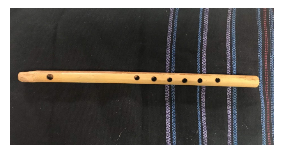
Figure 3. Picture of pi-u (u-maw)

The producer of the pi-u faces obstacles: the saw khae bamboo used to make the pi-u has of late been on the decline, so much so that nowadays it can only be found in one watershed and is in danger of going extinct.<sup>6</sup> It is sometimes used to make fishing poles and traps.