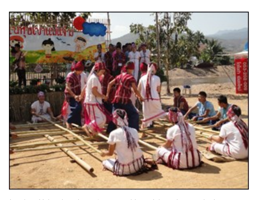
Figure 4. Performing the jikli bamboo dance (Source: Chi Suwichan Phattanaphraiwan, January 20, 2014)

To play the pi-u/u-maw requires that breath be sent through the bamboo. When one stops blowing, the sound ceases. This acts a metaphor for human life for the Pgaz k'Nyau. One day, our breathing will cease. While living, our breathing produces sounds and melodies, allowing others to learn, remember and benefit from our existence.