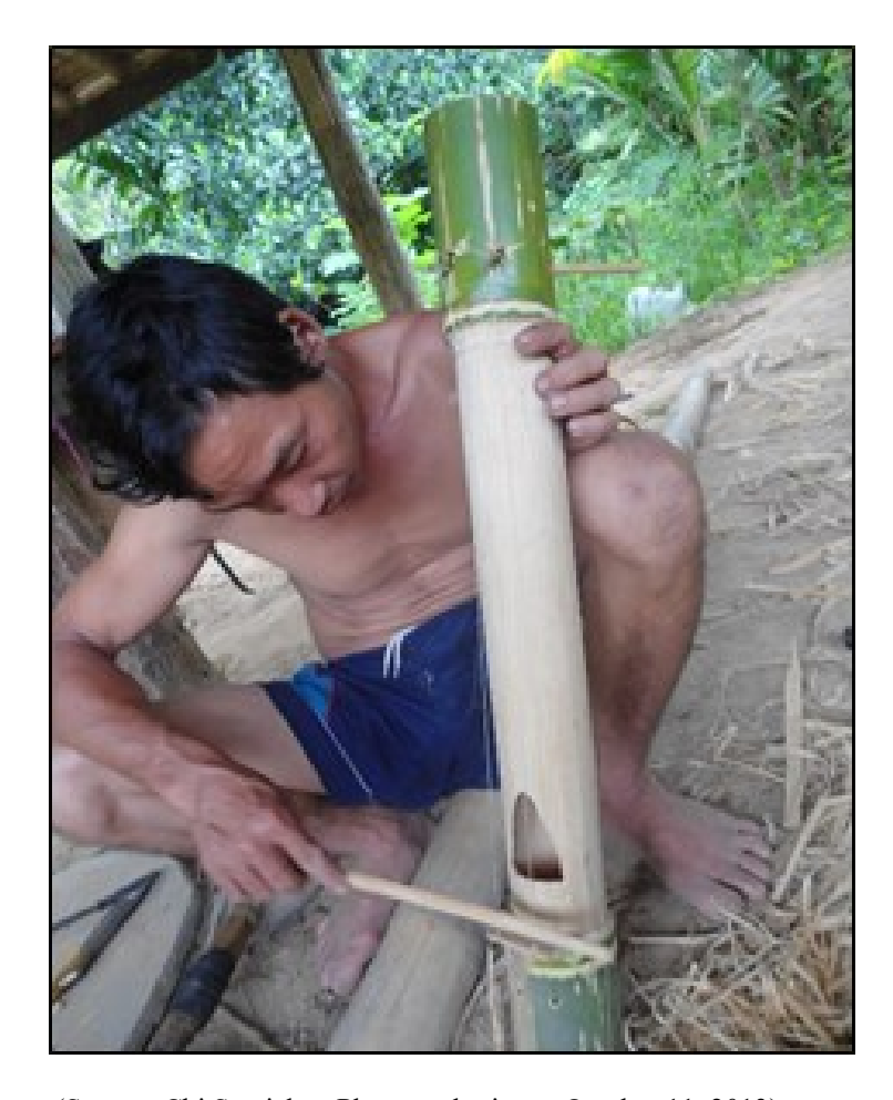
Figure 10. Bowed saw-tru

As soon as we migrated to this place (Pongluek-Bangkloi), we could not make a living. We were limited in land sufficient to grow rice, so we didn't plant rice. We saw no reason to play the saw-tru . But now that we've reintroduced it, we have noticed more and more pigs in the forest. There were hardly any there before, but now we want to have the saw-tru played more. However, we only have saw-tru player left.