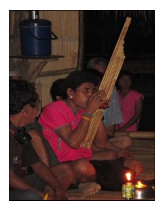
Figure 2. Young Karen man plays the pi-ba