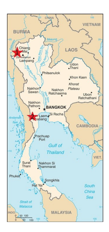
Figure 1. Map of Thailand