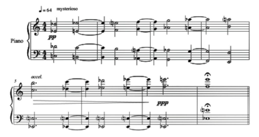
Figure 2 Piano chords of ninths and sevenths.