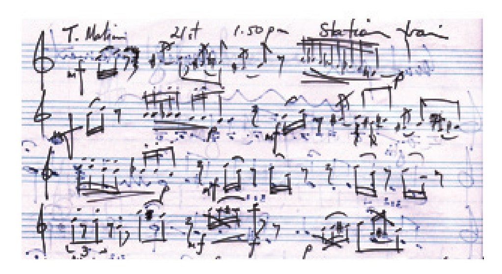
Figure 9 Notebook transcriptions of birdsong.

During this task of transcription many decisions are made spontaneously. The calls are lowered many octaves so that they can be written within manuscript. The tempo is not indicated, however they are usually extremely fast. The 'rests' are approximate. From these rough notes was the concert flute part. The decision to have a concert flute was to enhance the timbre contrast of the 'B' section, and because the concert flute was better suited to this material.