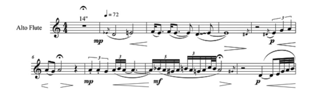
Figure 5 Alto flute ascending raga.

When the alto flute returns in the latter part of the work it is given the descending form of the scale an example of which is given in Figure 6.