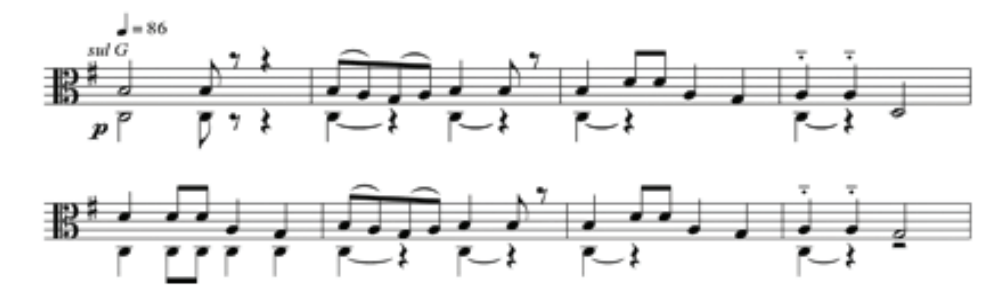
Figure 7 Kalimantan folk-tune.

The next musical happening, which was derived from the Orang Asli culture, was given to the viola. This instrument's first utterance was material derived from a Kalimantan folk-tune called Kajat Petuyang. This folk-tune was a simplified transcription of a Sape recording found on the public domain of Youtube (http://www.youtube.com/watch?v=1OhAmy54CSQ). This tune used the pentatonic scale in its pure form, but in this project the transcription was given a drone note as well (Figure 7). The excerpt given in Figure 7 is from the 'B' section of the overall work, and in stating this the problem of solving what form the work should take is given away.