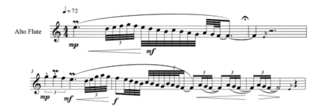
Figure 6 Ascending realization of the raga.

When the alto flute returns in the latter part of the work it is given the descending form of the scale an example of which is given in Figure 6.