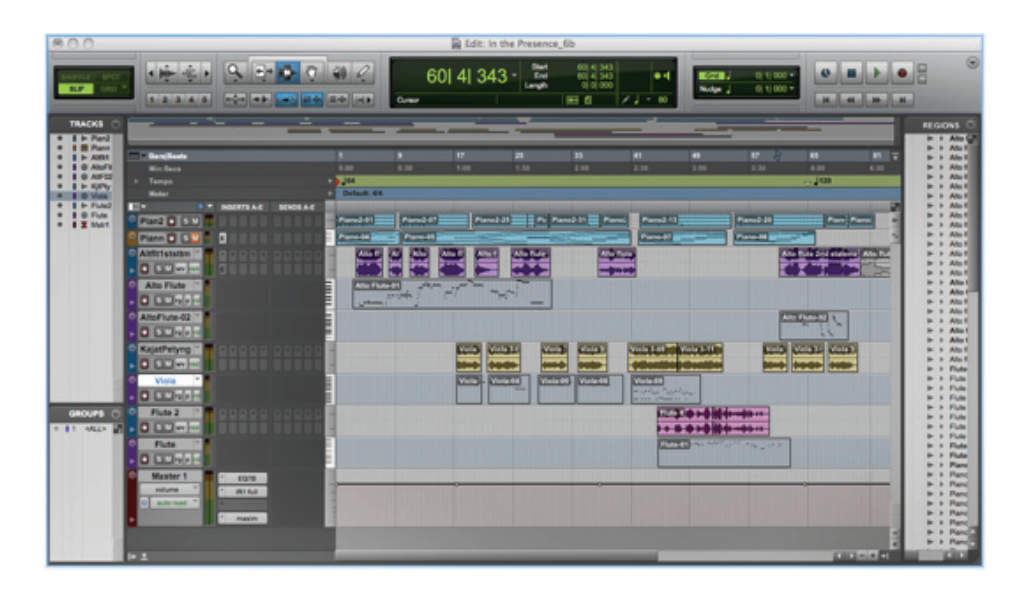
Figure 11 Picture of DAW.

Working in the DAW the author attempted to create a score that was sourced from the midi files, however this proved too difficult and in the end he had to resort to printing out the Finalé score files and to physically 'cut and paste' them to a sheet of paper to create a master score that the flautists and viola player could follow. What actually happened when the parts were given out and the rehearsals began was where the aleatoric component came to the fore.