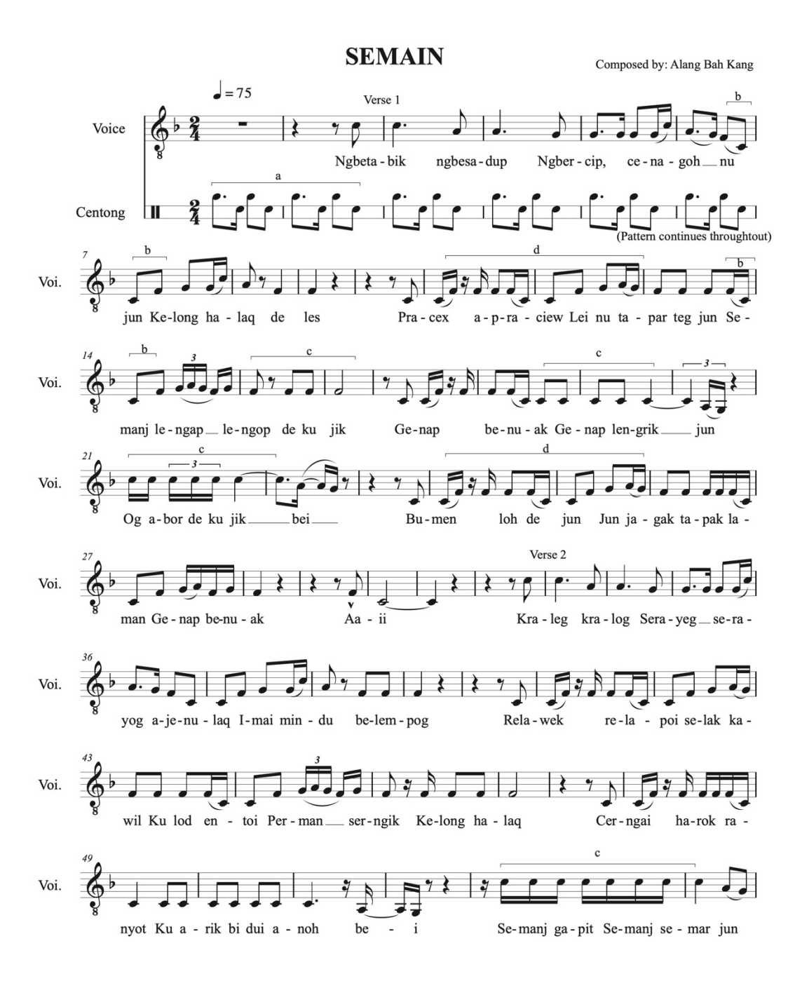
Figure 9. Excerpt from "Semain" (Chan, 2019, p. 35).