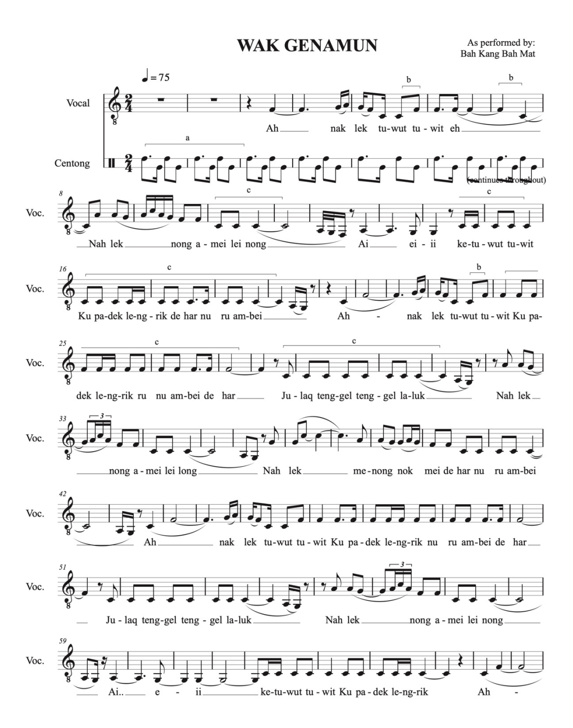
Figure 6. Excerpt from "Wak Genamun" (Chan, 2019, p. 21).