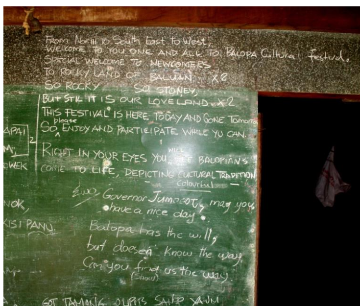
Figure 3 The English text of Mela Popeu’s polpolot Festival Welcome , written on a chalkboard at Mela’s home in Lipan village (photo by Tony Lewis, 2006)

This choice of languages in Mela Popeu’s compositions appears to be simultaneously looking inward and outward. The use of contemporary Ngolan Paluai looks inward to what is unique about Baluan, and at the same time using a language that is understood by most Baluan Islanders today; the use of English leapfrogs Tok Pisin, as it were, and looks outward, past broader Papua New Guinea, to a potentially international audience.