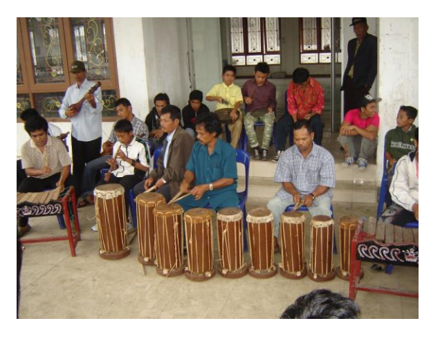
Figure 2 Pakpak children learning from the master.

It is also in these centres where the idiosyncrasies of performance can be taught even out of their original context. One example is the concept of the 'musical word' of the drums from Sub-Saharan Africa, which embody a 'cultural essence' and speaks with different messages that is linked to a social system or class, to a particular being, to a ritual, or to a specific extra-musical act (Kululuka, 2013).