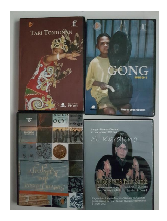
Figure 5 DVDs produced by Lembaga Pendidikan Seni Nusantara (LPSN).