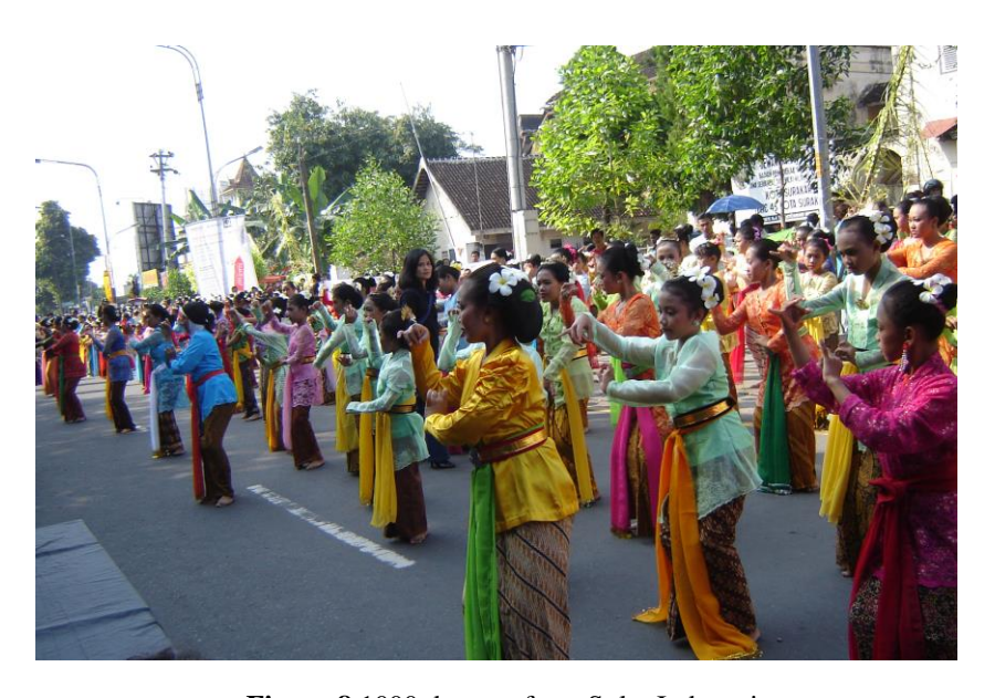
Figure 8 1000 dancers from Solo, Indonesia.

In these festivals, the traditional practices have been used and expanded into becoming mass experiential events. With the coming of mass culture, the materials for such events have been culled from customs and folklore, both ancient and modern, with the participation of various peoples from different cultures and ethnicities. In fact, these communal interactions have become traditions in themselves in the life of a modern society.