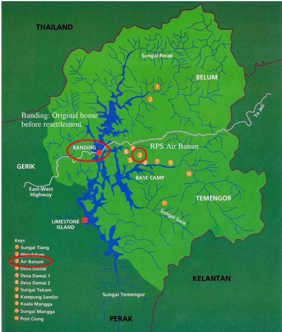
Figure 2 Location of Jahai villages before settlement (Banding) and after relocation in Rancangan Pengumpulan Semula (RPS) Air Banun (Source: Wonder Malaysia (2007-2016) 2 )

According to the Orang Asli Population Breakdown in 2010, the Jahai make up the largest population of North Aslian speakers, which accounts for up to 2,387 people out of 5,009 (The Department of Orang Asli Development (JAKOA), 2010, See Table 1). The Jahai groups in peninsular Malaysia are scattered across northeast Perak and western Kelantan. There has been little documentation on Jahai as a specific group; therefore, I also draw from literature reviews of the Jahai as a category of the Negritos. In this article, I discuss the Jahai group whose original