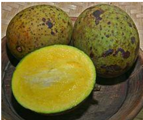
Figure 9 The salom fruit (scientific name: Mangifera foetida ) or buah bachang/ machang (local Malay name) 8

Form and technique. A similar ‘call and response’ style of singing is employed by Enjok bin Kimbis in the pinloin ‘Salom Pangwei’. A new melodic line is alternated with a refrain (A). The song text to the refrain is ‘Salom Pangwei’. New and old melodic lines are randomly repeated after it has been introduced the first time. The form for the ‘Salom Pangwei’ song is BA, CA, DA, EA, CA, DA, FA, EA, CA, DA, CA. A is a repeated motif while B, C, D, E and F are new melodic lines interspersed between A. Similar to the previous songs, Enjok’s rendition of the pinloin ‘Salom Pangwei’ reveals that the meaning of song text is not connected with the title. The singing style as observed in the music score is a ‘call and response’ between the soloist and chorus (Figure 10).