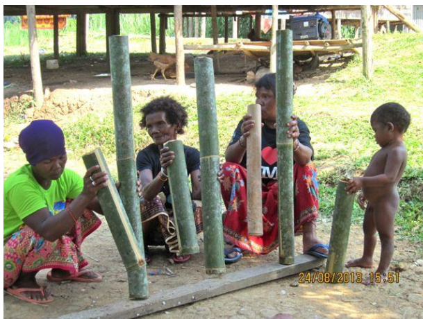
Figure 3 Jahai pinloin ensemble in Kampung Sungai Tiang, Royal Belum State Reserve Park.

2016. Through an analysis of song text composition in these three periods, I argue that there is an increase in the use of a pastiche approach including random sharing of fragments of song texts, sporadic unfolding of narratives and little connection between the title and song text to singing pinloin due to the influence of the ‘tourist gaze’.