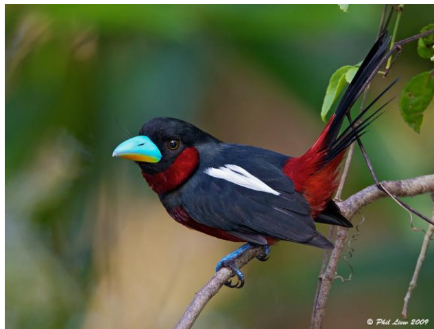
Figure 7 The black-and-red broadbill (scientific name: cymbirhynchus macrorhynchus ). 6