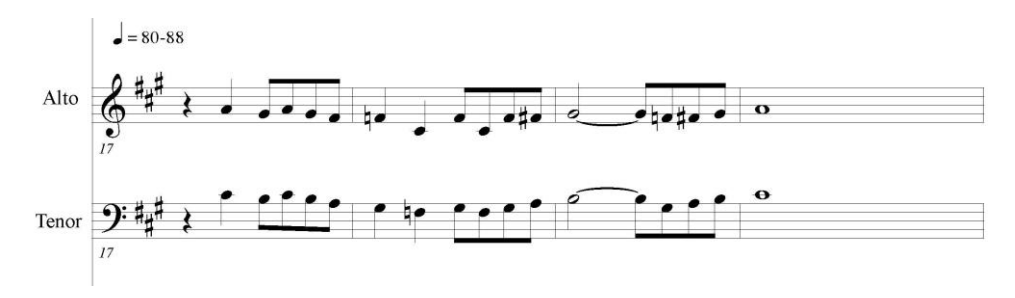
Figure 5. Saxophone motif (measures 17-20).