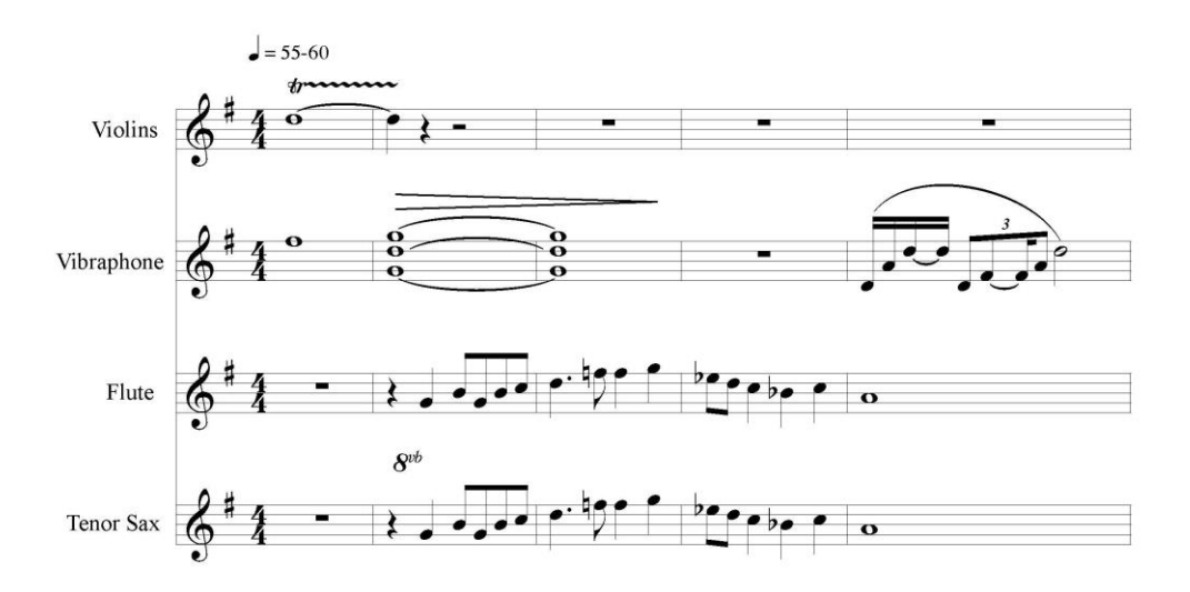
Figure 7. Instrumental introduction to the love duet, 'Berpadu Budi'.

The sequence of musical codes in the title theme sonically encapsulates the major narrative themes of the film. The musical themes are framed by the Javanese gamelan melody indicating the limited appearance but major role played by the Majapahit Empire in the story. The Dang Anom leitmotif played by the violin section refers to the cautiously optimistic idealism and love between the two main protagonists. In this, the violin signifies an 'authentic' Malay tradition as it has for centuries been integrated or adapted into Malay folk ensembles since the Portuguese colonial presence in the region.<sup>10</sup> The tension between 'tradition' and 'modernity'