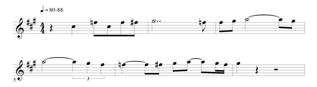
Figure 4. Violin motif (measures 1 to 5).

The instrumental music of the opening credits reiterates a 'freedom motif' as termed in Peters' analysis of Zubir Said's film music (2012, p. 87). I will call this melody and related variations the 'Dang Anom leitmotif' due to its frequent occurrence in the film and the centrality of the main character. Following the Javanese melody, the Dang Anom leitmotif (Figure 4) is announced by the violins (measures 2 to 7), rearticulated by a two-part saxophone section (measures 17 to 20, Figure 5), and finally, a solo electric guitar melody (measures 25 to 28, Figure 6). This motif is repeated in various orchestrations throughout the film, especially in the love duet between Dang Anom and Malang ('Berpadu Budi [United Gratitude]'), Dang Anom's lament and the final scene of the film where Dang Anom's father discovers his dead daughter (Peters, 2012, pp. 87-88). For example, the Dang Anom motif is articulated by flute and saxophone in this excerpt from the instrumental introduction to 'Berpadu Budi' in Figure 7 (measures 1 to 5).