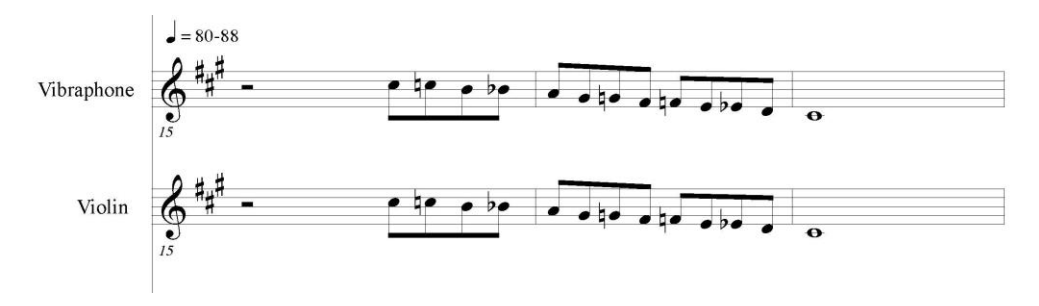
Figure 3. Chromatic descent (measures 15 to 17).

The instrumental music of the opening credits reiterates a 'freedom motif' as termed in Peters' analysis of Zubir Said's film music (2012, p. 87). I will call this melody and related variations the 'Dang Anom leitmotif' due to its frequent occurrence in the film and the centrality of the main character. Following the Javanese melody, the Dang Anom leitmotif (Figure 4) is announced by the violins (measures 2 to 7), rearticulated by a two-part saxophone section (measures 17 to 20, Figure 5), and finally, a solo electric guitar melody (measures 25 to 28, Figure 6). This motif is repeated in various orchestrations throughout the film, especially in the love duet between Dang Anom and Malang ('Berpadu Budi [United Gratitude]'), Dang Anom's lament and the final scene of the film where Dang Anom's father discovers his dead daughter (Peters, 2012, pp. 87-88). For example, the Dang Anom motif is articulated by flute and saxophone in this excerpt from the instrumental introduction to 'Berpadu Budi' in Figure 7 (measures 1 to 5).