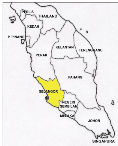
Map 1 The state of Selangor

1. The study area is the state of Selangor which is the most developed and richest state in Malaysia (Map 1. In terms of water supply, the service area of the Selangor water supply system includes the state of Selangor and the federal territories of Kuala Lumpur and Putrajaya.