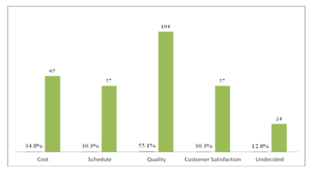
Figure 2: Respondents' feedback on the advantages of sustainability practices in building project.

The respondents were then asked for a response on sustainability integration into the green building project and whether it is beneficial for the project success or otherwise. Respondents were allowed to choose more than one answer for this question. Four choices of successful project performance measures were given: cost, time, quality and stakeholders' satisfaction. The findings are indicated in Figure 2. Only 14.5% of the respondents perceived that sustainability integration into the project planning process benefits all those four given successful project performance measures at once. 'Quality performance' was the highest choice of benefit by the majority of the respondents, returning the Total Influencing Percentage (TIP) of more than half of them, which is 55.1%. Meanwhile, the rest of the three measures – cost, time and stakeholders' satisfaction – were considered as secondary benefits of the application of sustainability into the project. The finding reflects the positive perception of the respondents towards appreciating sustainability concerns to achieve quality performance of a building project.