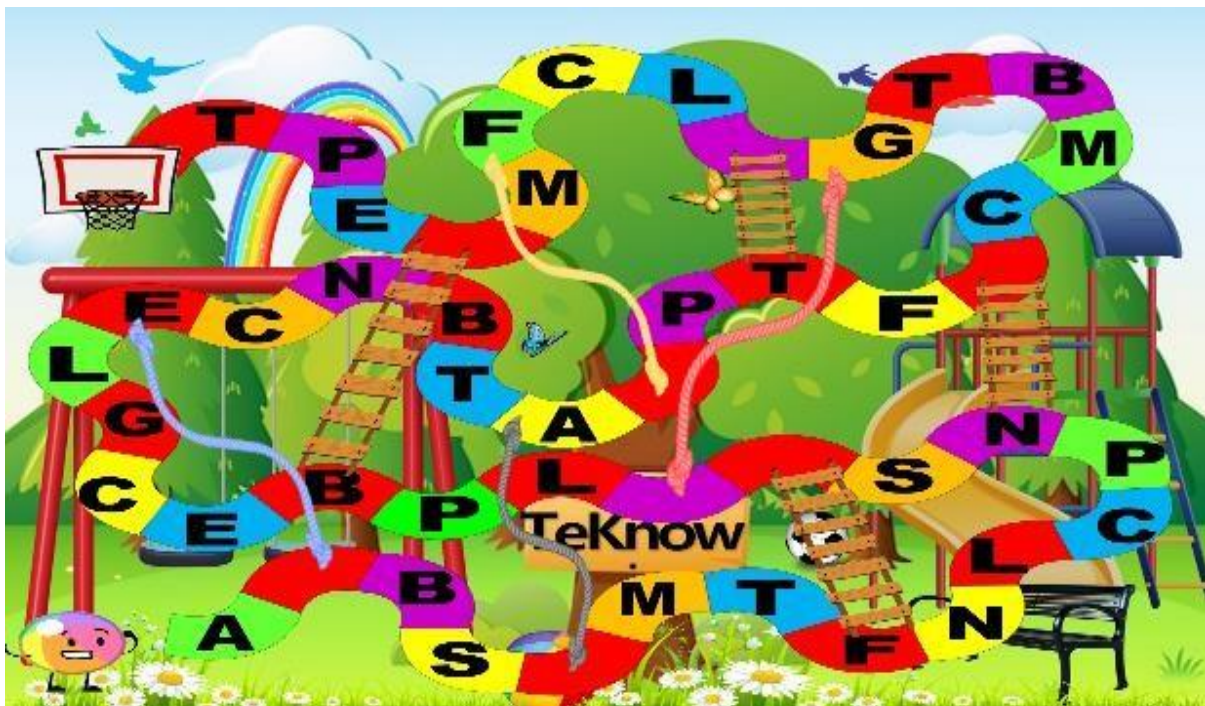
Figure 1. TeKnow Board Design.

A total of 27 students from NASOM's Pulau Pinang branch participated in this pilot study. The TeKnow educational game was introduced to them. TeKnow is a board game inspired by the Snakes and Ladders game. Compared to the existing game, TeKnow was being developed slightly different in a unique way (Wan Anisha et al., 2023). This game consists of a 10 x10 feet colourful board with playground design made with canvas materials. On the board, instead of using gridded squares, they are represented by a curve design similar like a snake body from the start until the end of the game. The curve line is separated into 50 spaces with a letter on it. Instead of snake and ladder, TeKnow uses ropes and ladders on the board. TeKnow also consists of a large die, a guideline card for the instructor and a few cards which consist of questions on spelling and vocabulary for the instructor to refer. Each card was printed on a laminated A5 thick paper size. Figure 1 shows the design of the TeKnow board.