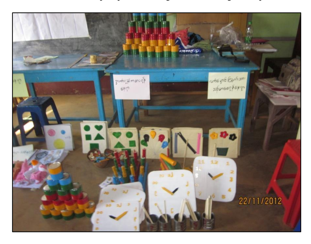
Appendix A: Toy materials made with the help of parents, caregivers, and villagers for preschoolers.