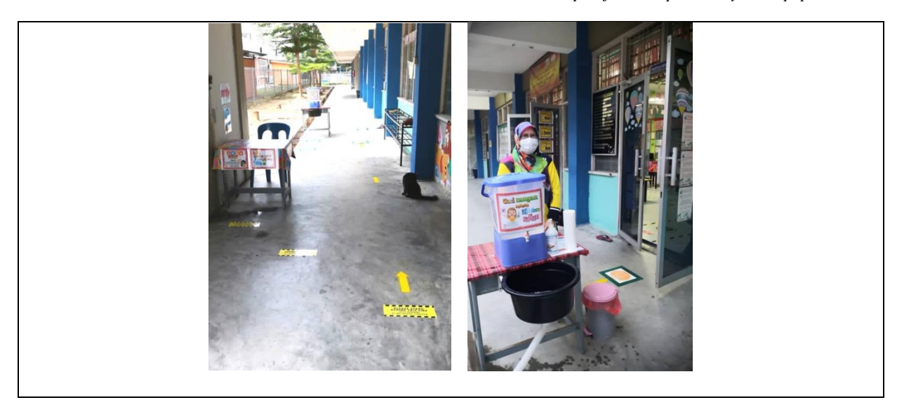
Figure 2. Preparation conducted by the teacher and administrators to welcome preschoolers during MCO period.

Although there were many preparations required such as labels, walking and pathway symbol markers, movement instructions and reminder posters and stickers, the teacher and administrators were able to prepare and display it clearly around the preschool centre for the parents, children and visitors. As for the preschoolers, big and clear posters were required as they can see it clearly and remind them of the importance of following the SOPs according to the new norm act. With the support from the administrators, the teacher burden of preparing the materials were also eased.