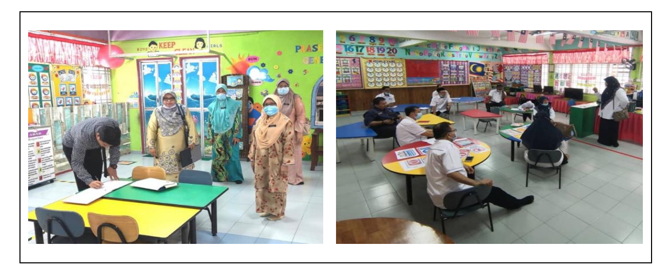
Figure 3. Meetings, discussion and inspection with pre-school administrators, teacher and Parents Teacher Association (PTA) to the pre-school centre.

There was good communication among the teacher and parents's in providing updates and latest information regarding the SOPs conducted. This is important as parents will receive the latest updates and information pertaining their children especially about the compliance of SOPs in the preschool centre. Parents were also be seen to be active in their participation in the preschool management during the MCO period as this is the only way for them to get updates on the preschool operation.