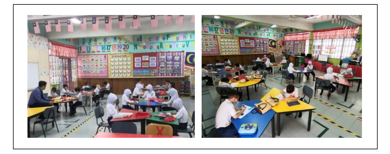
Figure 5. Limited seating for each preschoolers as following the social distancing guideline.

limited movement and touching situation between the children. Individual tasks were given to replace group work activities that may increase the interaction and movement among the preschoolers. Although individual activities may give difficulties to the children but with the assistance and guidance from the teacher, the children were able to follow the instructions given in the classroom. The teacher needs to always remind the pupils about the SOPs and the importance of it. Outdoor classroom activities were also cancel and being replaced with indoor games and activities. Nevertheless, the games and activities that being carried out were planned early and emphasised on individual movement instead of grouping actions.