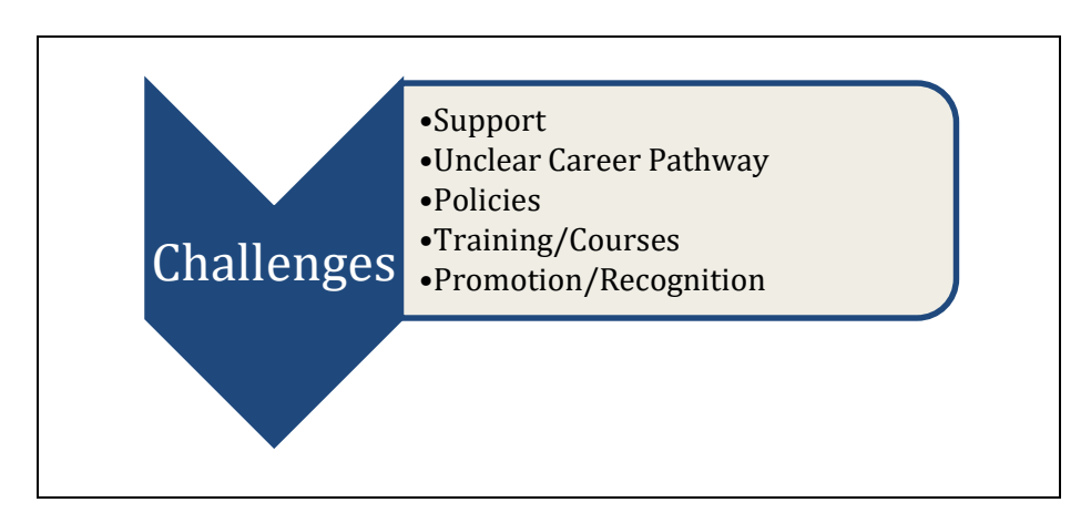
Figure 1. The main challenges in career pathway of ECCE Educators.

are accordance to the needs and capabilities of the agencies involved. The challenges related to career pathway confronted by the in-service edu-carers as well as the service providers are summarized in the below figure. There are five categories that contribute to the career pathway challenges.