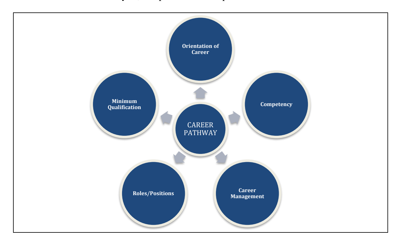
Figure 2. Career pathway minimum qualification orientation of career competency career management roles/ positions.

The findings show there are five important elements that contribute to the development of career path among the ECCE educators. The analysis of data from interviews, document analysis and survey has disclosed the elements needed in developing the ideal framework for ECCE career pathway. Among them are academic qualifications and skills in ECCE qualification. These include the; (i) appropriate plan of career pathway for each individual; (ii) assessment carried out by the superiors to identify individual's performance and its implication to the children development; (iii) sufficient and appropriate trainings either skills or knowledge; (iv) requirement of incentives and reward for self-improvement; and (v) the support, encouragement and facilitation from the superiors. All findings have been analysed and simplified into career pathway framework for ECCE for better understanding, specifically early childhood educators (teachers, trainees, edu-carers). This framework is intended to provide and equip individuals to work well and be able to take responsibility for educating children holistically. The framework is essential to generate opportunities and values as a professional for early childhood educators. Each level is appropriate with its roles and responsibilities. Other than the academic and skills requirement for the appointment of educators at CECs in Malaysia, competencies of the personnel is also considered essential.