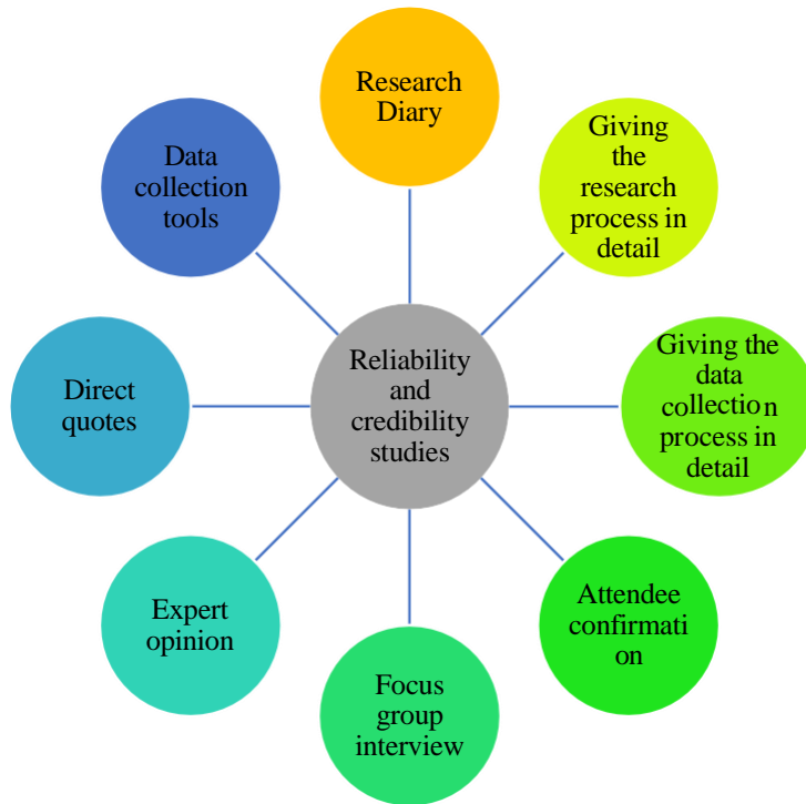
Figure 1. Reliability and credibility studies

In this study, to increase reliability and credibility, necessary corrections were made in line with the feedback by taking expert opinion while creating data collection tools. In addition, data collection tools are given in detail in the data collection tools section of the study. However, the accuracy of the interview data was ensured by obtaining participant confirmation in the focus group interview. In addition to these, the study results were supported by making direct quotations with the data obtained from the interview and research diaries. In addition, the data collection and analysis stages are explained in detail.