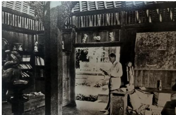
Figure 1. Walter Spies on his House in Ubud, Bali.