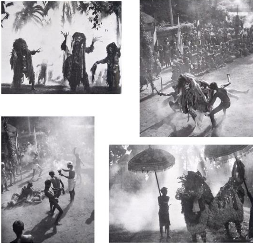
Figure 5. Using smoke effect for photo shooting process by Spies.

One of the iconic milestones in Spies' legacy is the Cak , (now better known as the Kecak Dance ), this performance was created by Spies with Limbak, a skilled dancer from Bedulu, a village east of Ubud. Spies' experience in documenting Balinese performances provides a deep sensation of the combination of sounds, voices, and songs in Sang Hyang performances in various types. Sang Hyang , which was originally a repulsive sacred performance, was composed with I Wayan Limbak in terms of movement composition, and asked for a cappella musical considerations from a music scientist Jaap Kunst who at that time was also intensely researching the art of music and gamelan in Bali. Rows of Balinese men are formed in a circle wearing sarongs tied, their hands are arranged, their bodies contorted and their voices are in unison. Forming a dynamic bustling dynamic. Presenting a Balinese wayang story with universal value taken from the Ramayana epic, in a fragment of Ravana kidnapping the Goddess Sita. The collaboration performance was originally danced at the Samuan Tiga temple, Bedulu, around Limbak's house. Then it grew very popular in several other areas in Bali. So that it has become a Balinese icon that is currently attracting international attention and simultaneously developing economic attraction.