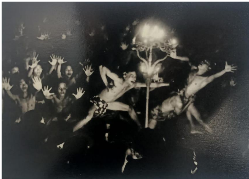
Figure 6. Cak 's performance was an important collaboration between Spies and Limbak.

Cak , a collaborative creation of Spies and Limbak, hereafter become Bali's most popular and economically valuable performing arts in the current tourism era. The Cak ( kecak ) is a dramatic dance performance that was created and staged for a tourist audience and has since become an important part of Bali's tourism economy. It's quite possible that Spies and his colleagues had no intention of developing it as such, and were instead focused on the artistic and aesthetic qualities of performance. Nonetheless, kecak became a source of income for Balinese villagers and was standardised as kecak Ramayana in the 1970s; it is still performed in this format today—as a static, easy-to-sell performing art (Stepputat, 2012).