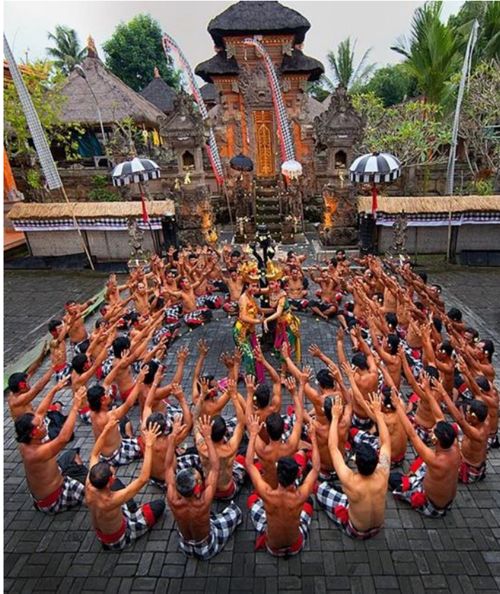
Figure 7. Cak (now better known as Kecak dance), collaborative creation of Spies and Limbak, Bali's most popular and economically valuable performing arts in the current tourism era.

However, this impact is extremely difficult to pinpoint, let alone quantify. Individuals are influenced by a wide range of cultural activities (Frey & Briviba, 2022) from artistic experiences in performing arts, architecture, even the social networks that they uphold in local institutions and religious ritual. This influence is multidimensional and composed of many concurrent forces.