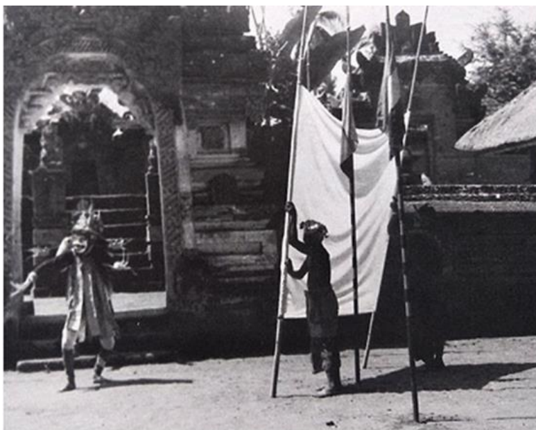
Figure 4. Balinese assistants helped Spies take photos with a light reflector.

Previously, in sacred Balinese arts performances, such settings were never or even not permitted. However, when it comes to lighting, Spies succeeded in including it as an important element in photography. Apart from utilising reflector elements, Spies also includes artistic smoke to give a mystical feel to the lighting nuances of his photos. The fog effect usually always appears in the visuals of Spies' paintings. In the smoke effect, the use of back light as a silhouette nuance also appears as a mystical reinforcement in the unity of Walter Spies' photo. In terms of the shooting position, Spies also made important considerations, taking an angle from above, collaborating and planning carefully to build a tower at the shooting location so that he could get a different angle. This shooting position is very different from the position of Balinese people who usually have to sit, in a kneeling or cross-legged position in appearance. Especially when the barong scene appears on stage.