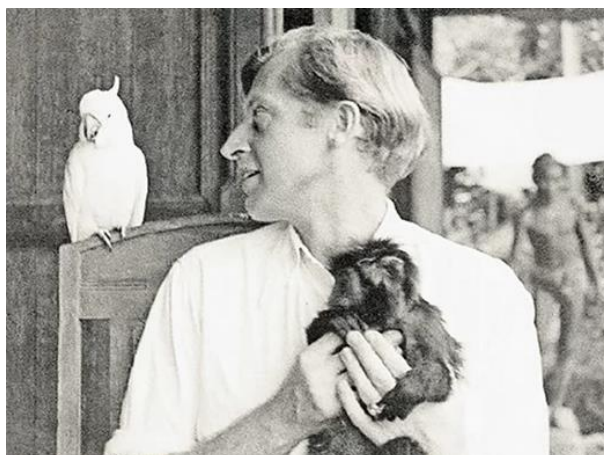
Figure 2. Walter Spies portrait.